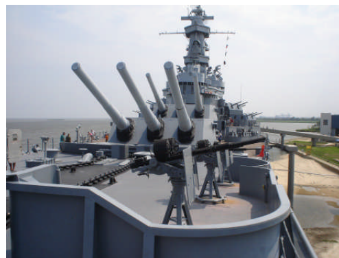
The big guns of the battleship USS Alabama (BB60) resting at Battleship Memorial Park on Mobile Bay.